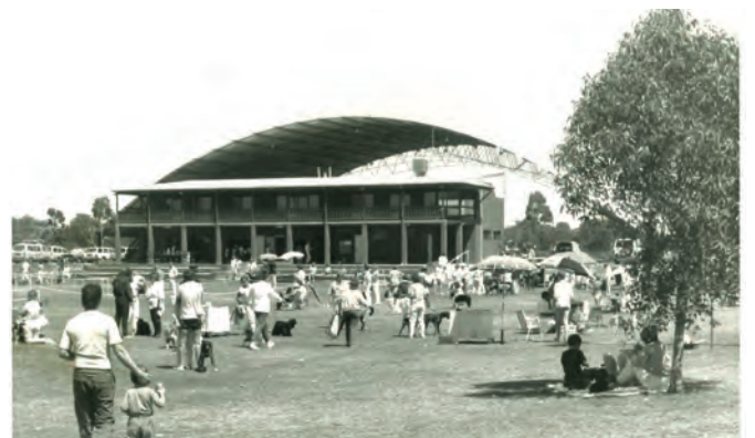
Thank you to all the past volunteers that established this wonderful facility for the present members to enjoy. As the grounds are well developed now, it would be nice to see some of our present members volunteering more often to assist the affiliates conduct events which is an area in great need.