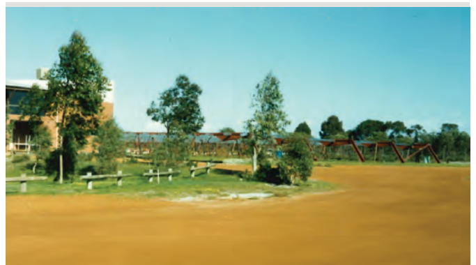
Oh how lucky we are today with our beautiful new bitumen roads. The original roads around the main arena were rolled orange gravel – not the best to walk your coated dogs over during winter.