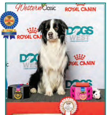
Intermediate FS GR CH HTM GR CH O GR CH R GR CH NOBLESTARZZ CHASE THE ACE