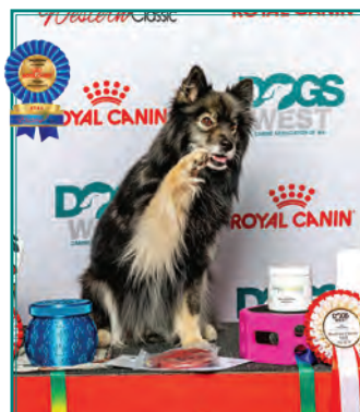
Advanced TRI CH (A) (FS) Mirawee Heartsong