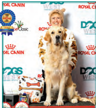
Novice HAPPYBEAR GLITZ N GLAMOUR