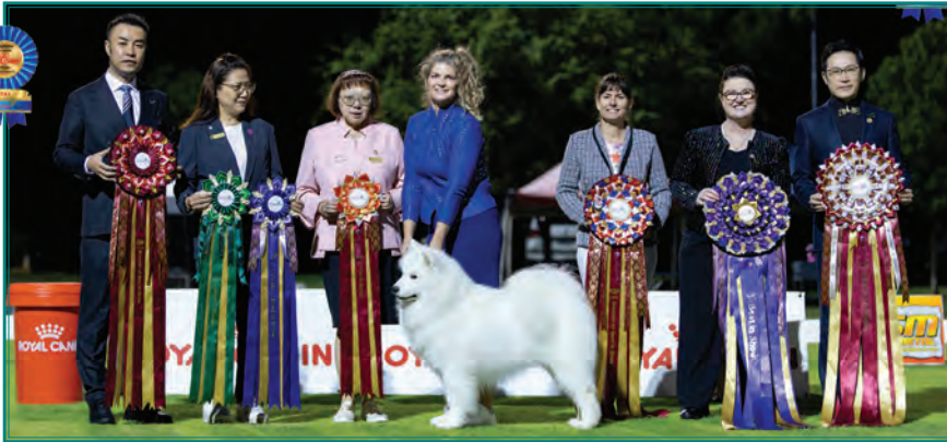
Best In Show & Australian Bred In Show SUP.CH. LUNASEA WHY SO SERIOUS JC. SPRD Samoyed - Miss C Wiles

Western Classic Championship Show 1 March 2026