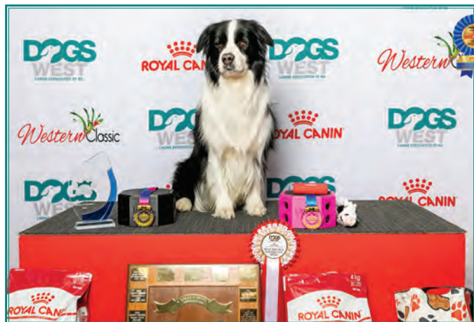
Intermediate FS GR CH HTM GR CH O GR CH R GR CH NOBLESTARZZ CHASE THE ACE