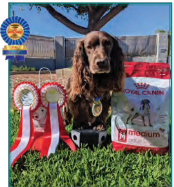
Masters R CH Albionshore Spell Weaver