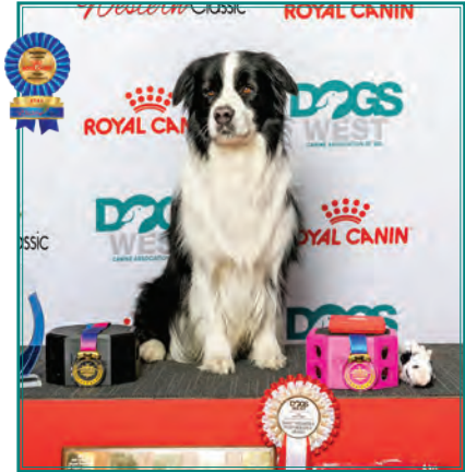
UD & UDX FS GR CH HTM GR CH O GR CH R GR CH NOBLESTARZZ CHASE THE ACE