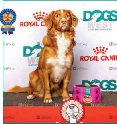
CD CH Ptolomy Red Delicious