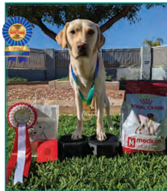
Excellent Boommagic Here Comes Dooley