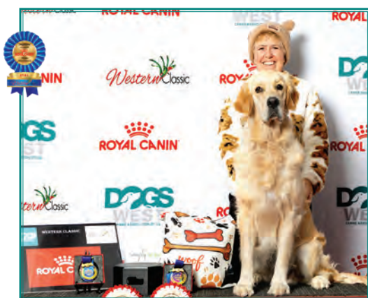
HTM Starter & CF Starter HAPPYBEAR GLITZ N GLAMOUR