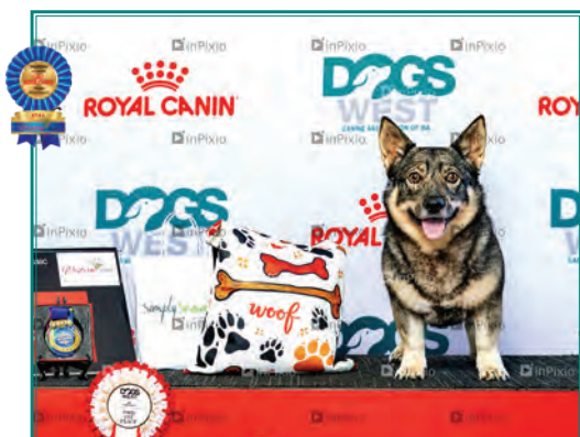
HTM Intermediate AG CH 300 FS GR CH HTM CH TRI CH (R)(FS) Ubique Don't Walk Awa