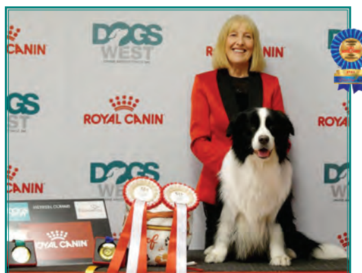
HTM Advanced & CF Advanced FS GR CH HTM GR CH O GR CH R GR CH NOBLESTARZZ CHASE THE ACE