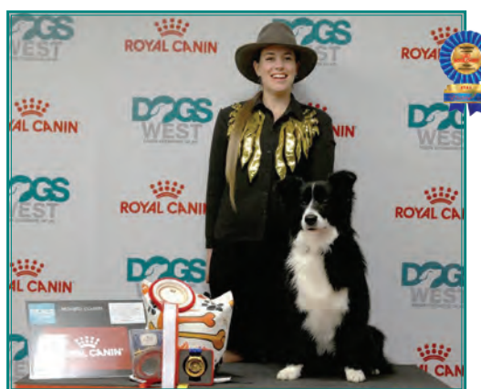
HTM Novice TRI NEUT GR CH (T) (TS) WINPARA DELTA V