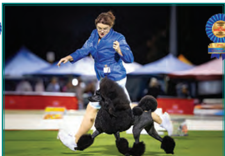
BEST IN SHOW 2ND SUP.CH. FIREZEYE COUNTRY GRAMMAR Poodle (Standard) - Mrs V Parke