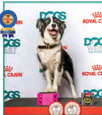
Advanced Ozziedust Sks Skys The Limit