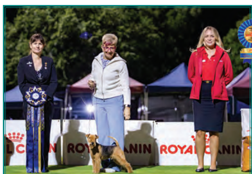
EXH BRED IN SHOW SUP.CH. KINETA ROCKETMAN Lakeland Terrier - Ms E A Fekete