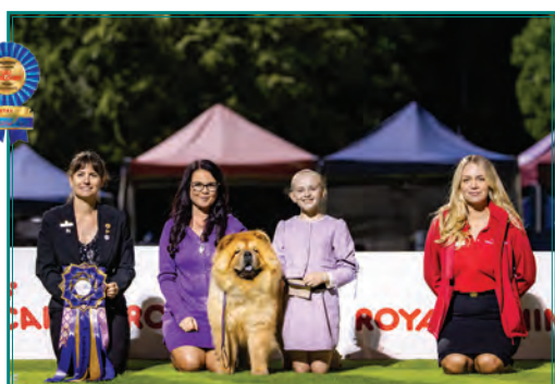
AUSTRALIAN BRED IN SHOW CH. SHERAE RED MOON SPIRIT DRAGON(AI) N.SPRD Chow Chow - Miss N Rhodes