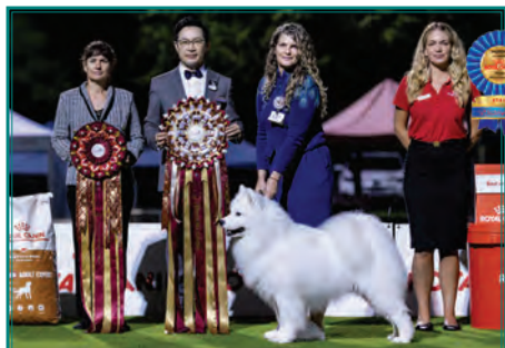
BEST IN SHOW 1ST SUP.CH. LUNASEA WHY SO SERIOUS JC. SPRD Samoyed - Miss C Wiles

Royal Canin Dogs West Classic Championship Show 27 February 2026