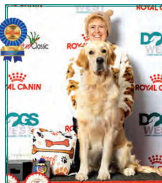
Starter HAPPYBEAR GLITZ N GLAMOUR