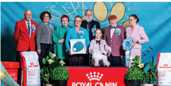
NEUTER OF THE YEAR WINNER - Karlyermai Kennels - Poodle (Toy) CH NEUT CH PUDELIAN BIT OF LUFF ON THSIDE AT FIREZEYE