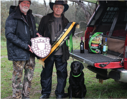
LRC of WA - RESTRICTED