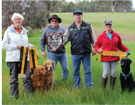
LRC of WA - FLASH MEMORIAL