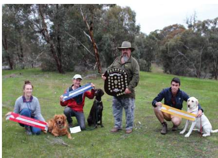
RC of WA - NOVICE