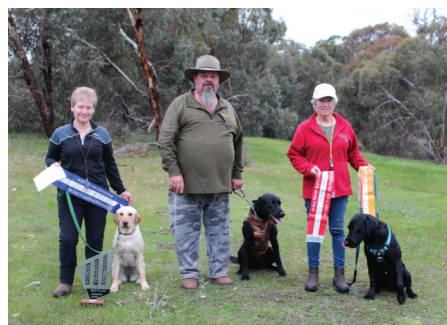
RC of WA - RESTRICTED