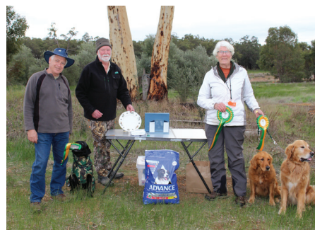
GDC of WA - ALL AGE