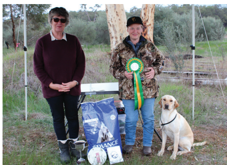
GDC of WA - RESTRICTED