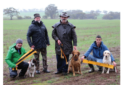
LRC of WA - NOVICE