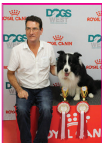
Rally Masters - Nahrof Trick Olight