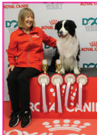
UD - Noblestarzz Chase The Ace