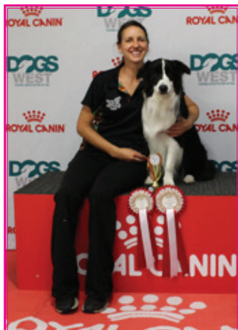
CCD - Dayre Prodigy Of The Dragon