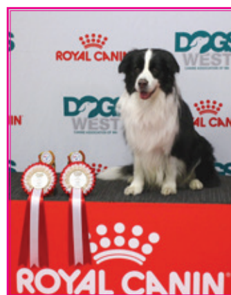
HTM Adv, FS Adv, Trick Novice - Noblestarzz Chase The Ace