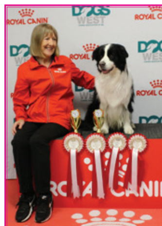
Excellent - Noblestarzz Chase The Ace