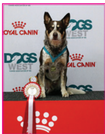
FS Inter - Rusty