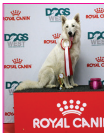
HTM Starter - Rosamontana On Fire