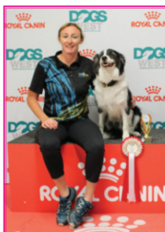
Advanced A - Ozziedust Sks Skys The Limit