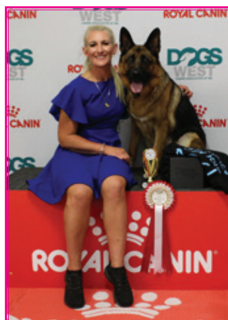
CD - Sabaranburg Xzara