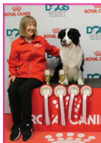
Excellent - Noblestarzz Chase The Ace