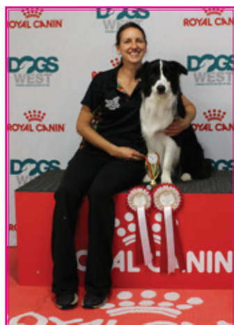
CCD - Dayre Prodigy Of The Dragon