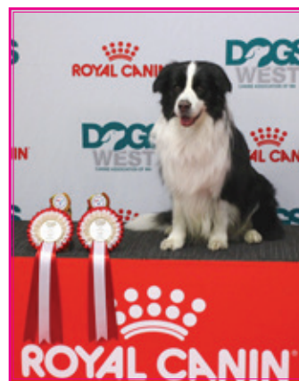
HTM Adv, FS Adv, Trick Novice - Noblestarzz Chase The Ace