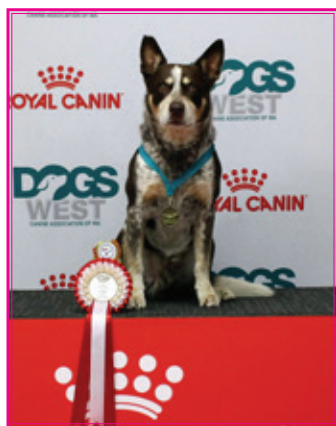
FS Inter - Rusty