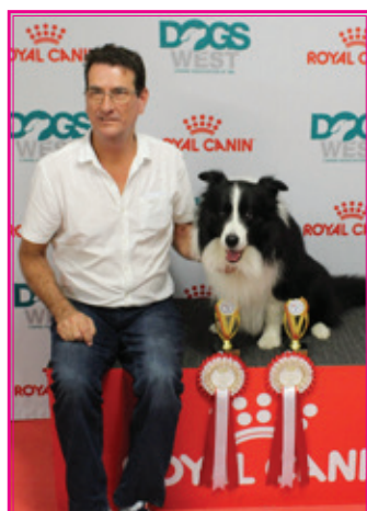
CDX - Nahrof Trick Olight