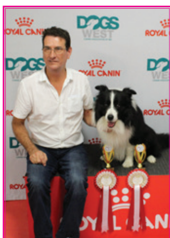
Rally Masters - Nahrof Trick Olight