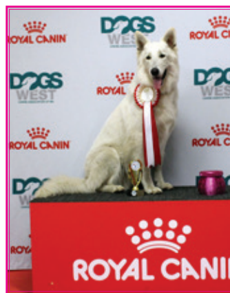
HTM Starter - Rosamontana On Fire