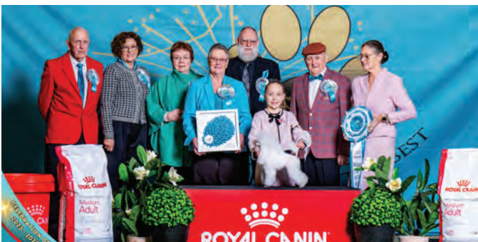
NEUTER OF THE YEAR WINNER - Karlyrmai Kennels - Poodle (Toy) CH NEUT CH PUDELIAN BIT OF LUFF ON THSIDE AT FIREZEYE